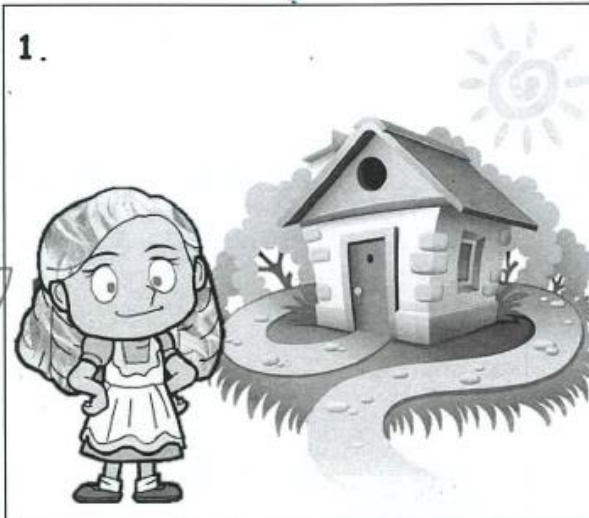
sunny day / the three bears' house