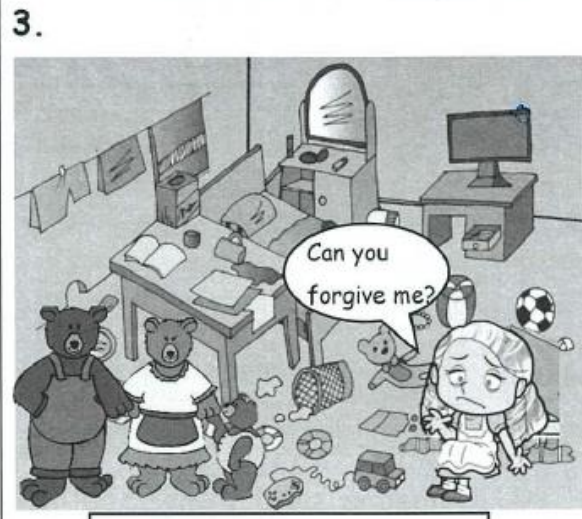
living room / messy